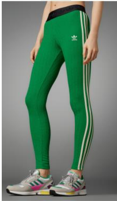
These is not one block colour