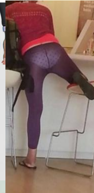
Not made from active wear material