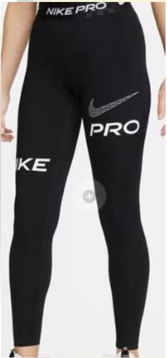
Logo can not be covered by hand